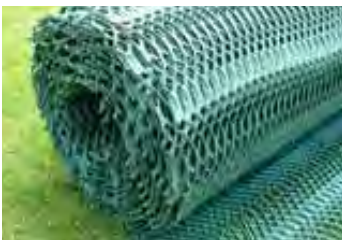
Unroll mesh onto existing grass