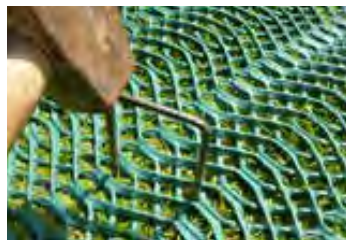
Fix using steel u-pins