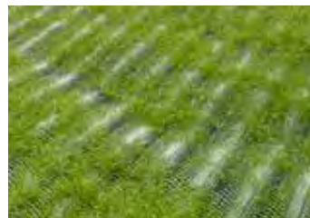
Allow grass to grow through