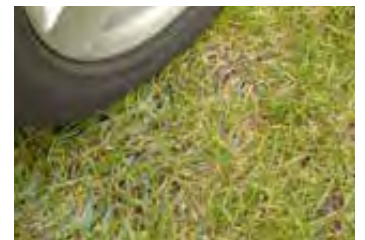
Grass in use after suitable period